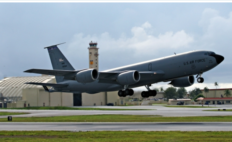
Headquarters, Pacific Air Forces Joint Base Pearl Harbor-Hickam, Hawai'i